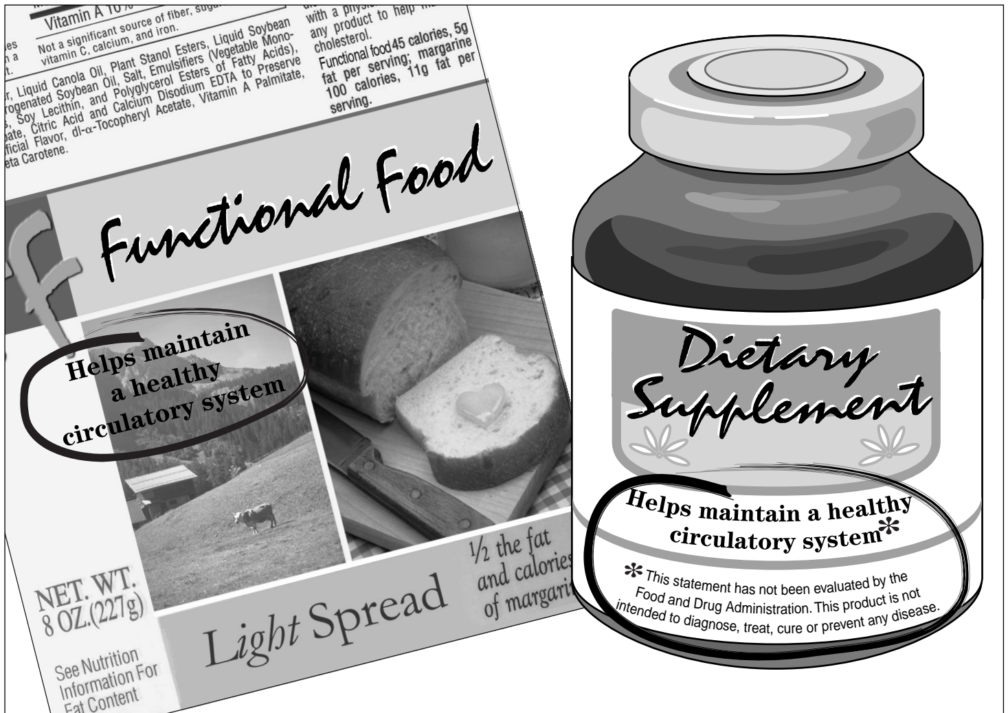
Figure 2: Hypothetical Comparison of Two Products Using the Same Structure/Function Claim—a Functional Food Without a Disclaimer and a Dietary Supplement With a Disclaimer

structure/function claim related to maintaining a healthy circulatory system would have to include the disclaimer on its label, but a functional food containing the same ingredient and claim would not. (See fig. 2.)